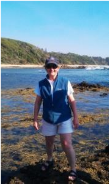
Staff from Woodbridge Marine Discovery Centre exploring the rock pools in Port Macquarie

The group also workshops on activity ideas for open ended investigations, exhibit design and school education programs.