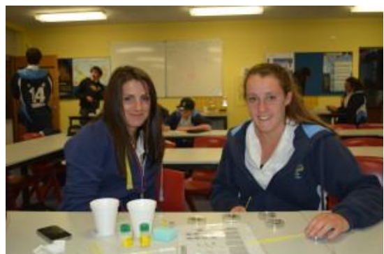
Students at Monaro High School in Cooma are ready to get the glowing started.