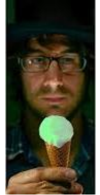
Glowing ice cream

Students saw how they can introduce proteins into bacteria to alter its DNA. In this case adding in a green fluorescent protein and making the bacteria glow under UV light. This sort of experimentation won the 2008 Nobel Prize in Chemistry.