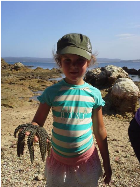
A happy rock pool Rambler holding an eleven arm sea star that was found at Shelly's Beach, Eden