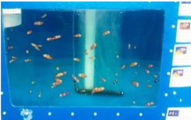
Clown fish breeding tank at the Port Macquarie Marine Discovery Centre

The weekend brings together over 10 marine discovery centres from around Australia to share ideas and insights into the world of marine education.