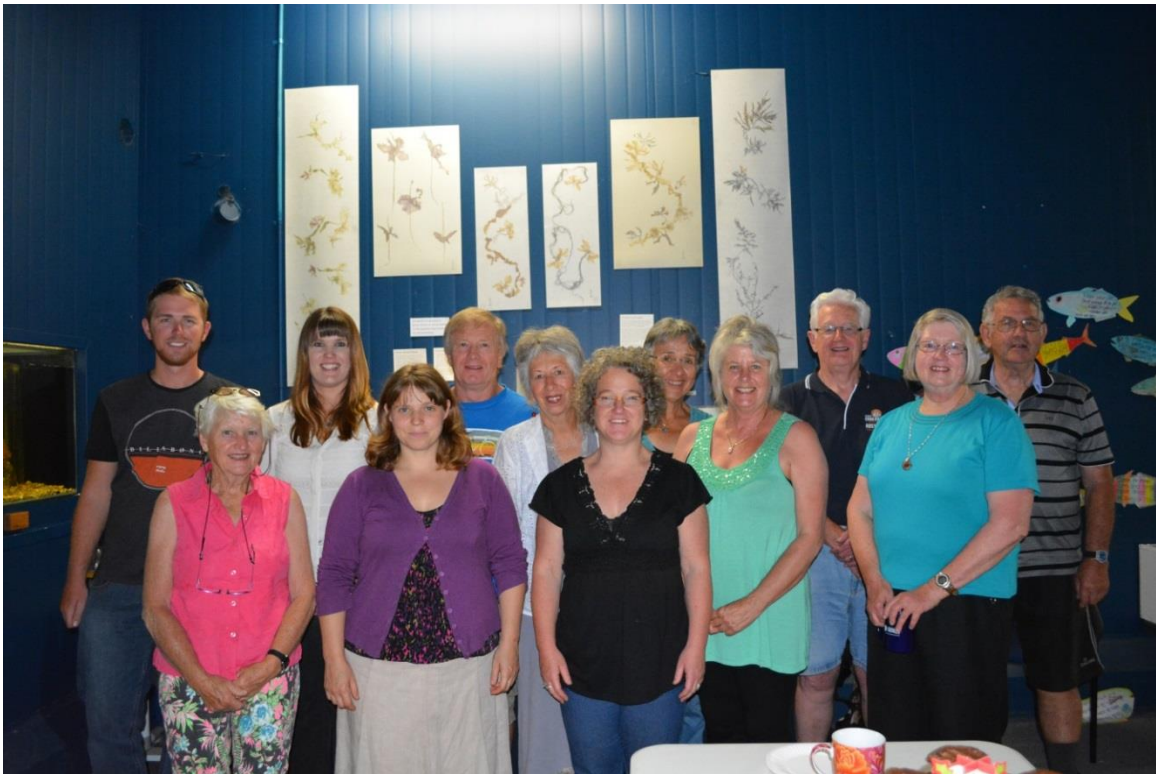
A happy time at the Volunteers Christmas Party

So again, on behalf of the staff and Board of the SCDMC, thank you VOLUNTEERS for all that you do and the help that you give.