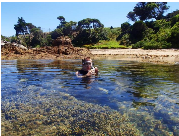
Snorkeling the clear waters at Shelly's Beach, Eden