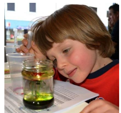
Visitors making fireworks in a jar at the Brain Break morning tea

The Open Day completed a very busy National Science Week for the Discovery Centre, which began with a Brain-Break trivia event at Sprout Eden on Monday and a fantastic Trivia Night on Friday. The Centre wishes to thank the many local businesses who supported the events with a wide range of great prizes.