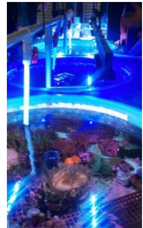
Coral breeding tank at the Port Macquarie Marine Discovery Centre

This year the conference was held at the Port Macquarie Marine Discovery Centre and all participants were impressed with their wonderful set-up including their own clown fish and coral breeding operations.