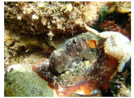
One of the many Gloomy Octopus spotted during a snorkel at Shelly's Beach, Eden

All our visitors have had a wonderful marine adventure within the centre and on our outdoor activities.