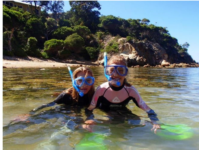
Visitors enjoying a lovely snorkel at Shelly's Beach, Eden