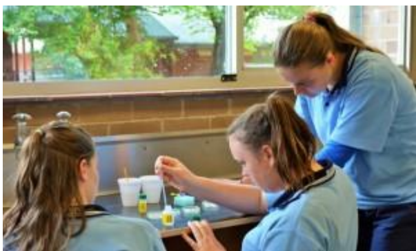
Students at Bega High School participating in the Glowtastic program