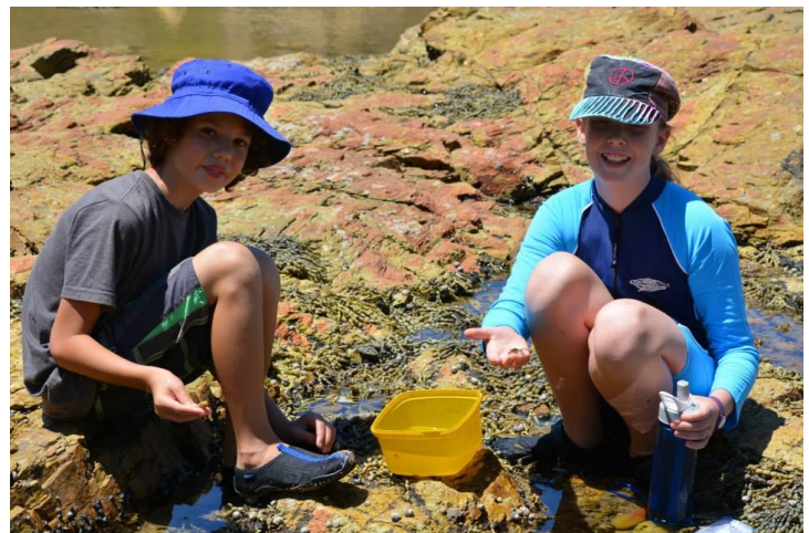
Finding sea stars and snails galore while rock pooling