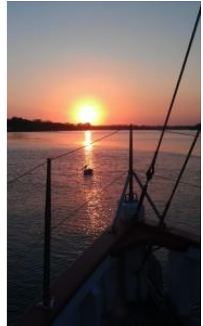
Beautiful sunset from the XLCR