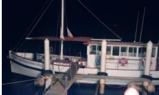
XLCR, a restored boat run by the Port Macquarie Marine Discovery Centre

It's not all hard work though, we also get to get out and experience the local marine environment through kayak trips on the river, snorkels in the bay and a boat trip on the XLCR owned and operated by the Port Macquarie Marine Discovery Centre.