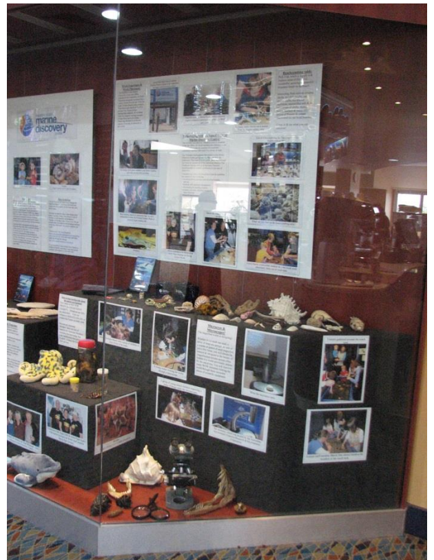
SCMDC display at the Merimbula RSL club